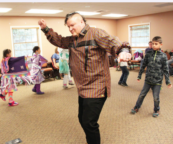
Images from the Spring 2017 Anishinabe Performance Circle Dress Rehearsal